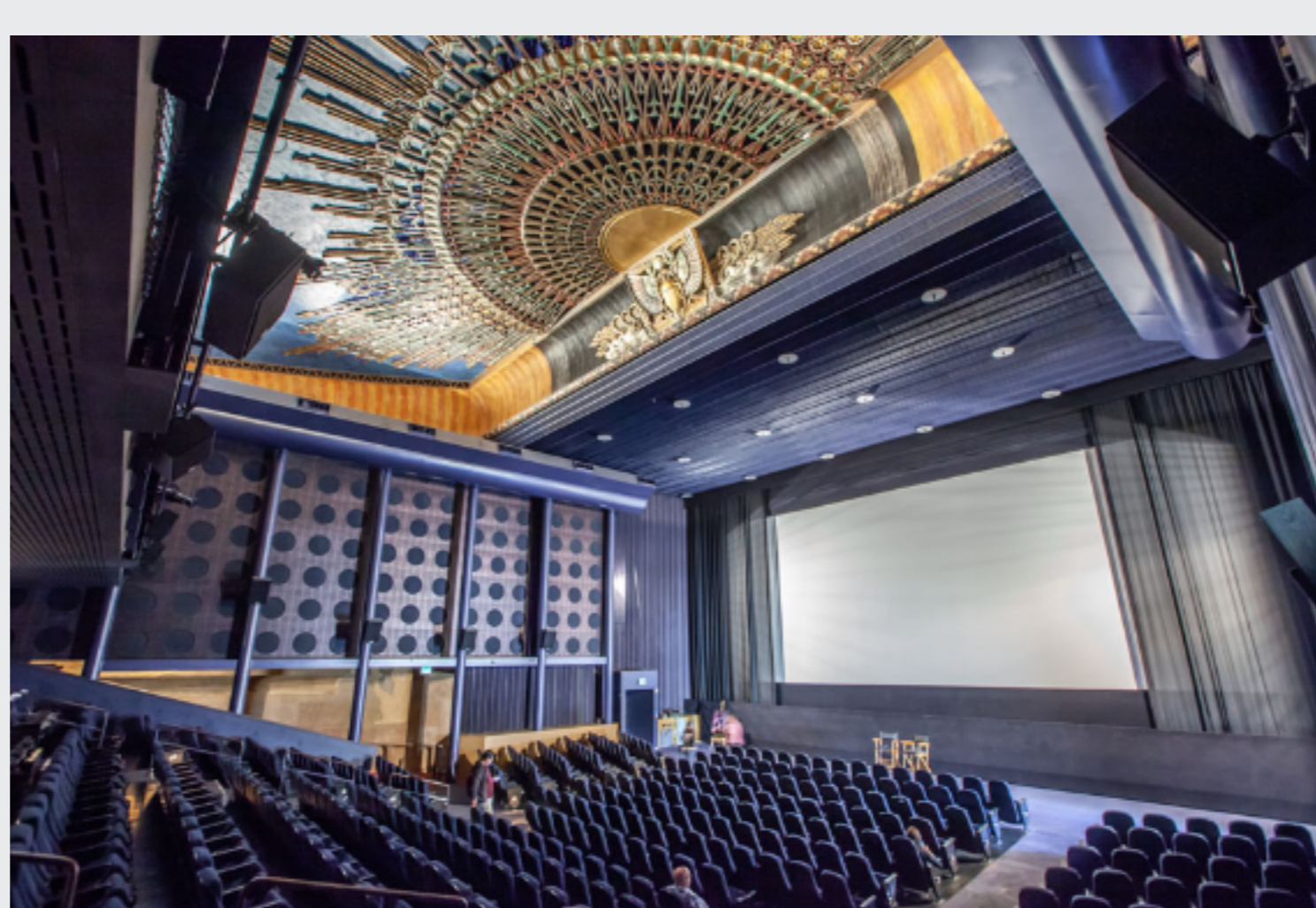
The Egyptian Theatre's auditorium, with 1990s alterations in blue. Note the elaborate plasterwork sunburst ceiling with winged scarab (associated with the Egyptian god Khepri) in the center. The scarab was originally backlit with multi-colored lamps, a feature LAHTF has asked Netflix to include in the auditorium's restoration.