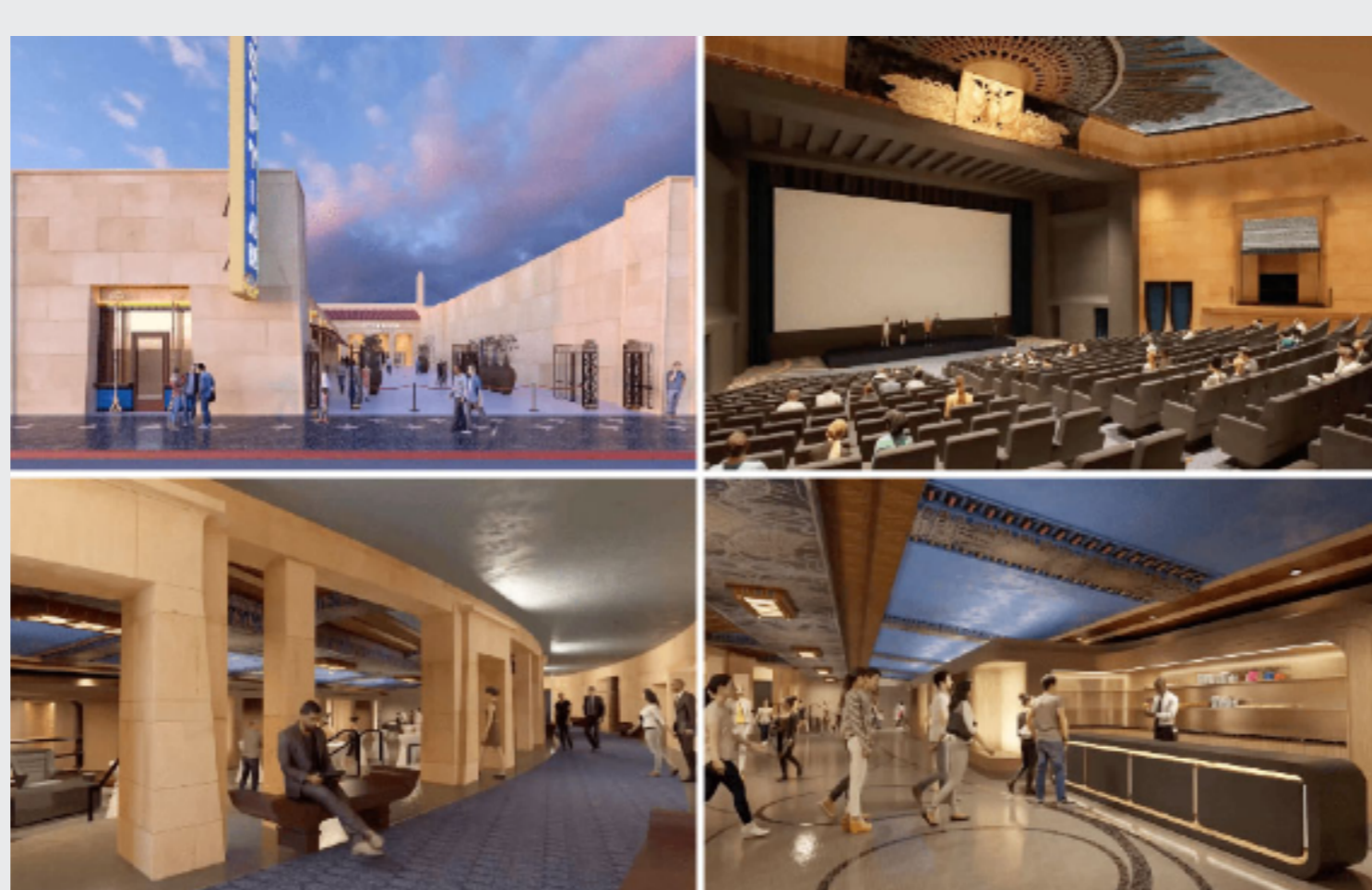
Project renderings by Netflix, as published by What Now Los Angeles .

Overall, LAHTF is encouraged by the direction of Netflix's project with its focus on the theatre's history, removal of non-historic elements, and restoration of the theatre's character. LAHTF looks forward to discussions continuing with the Netflix project team in order to address our concerns.