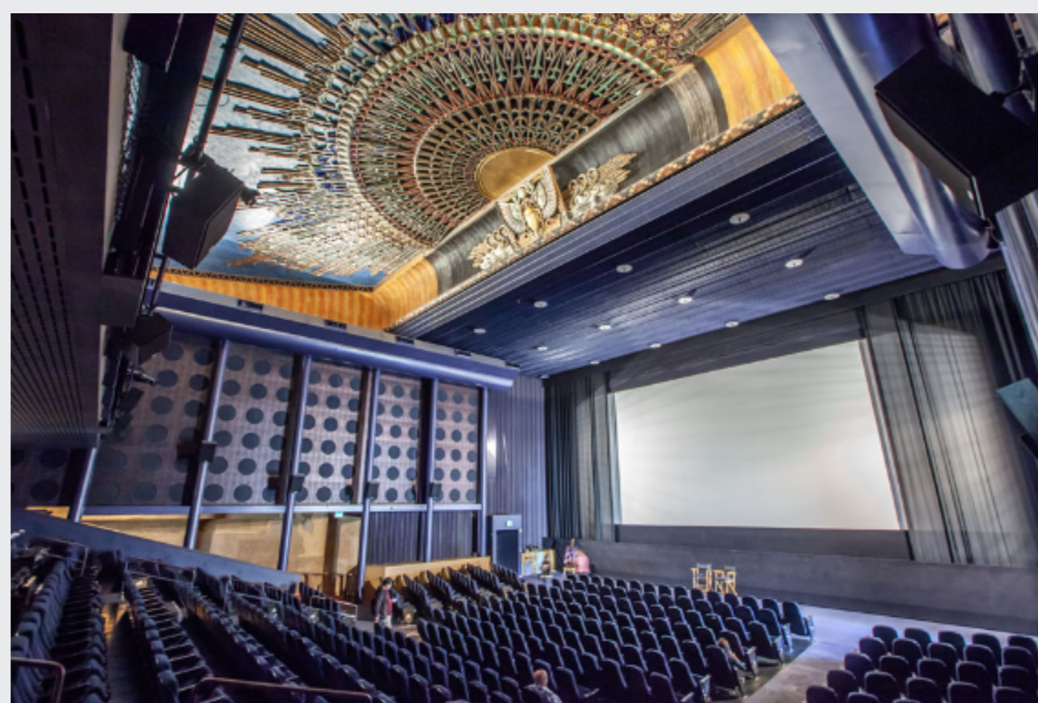
The Egyptian Theatre's auditorium, with 1990s alterations in blue. Note the elaborate plasterwork sunburst ceiling with winged scarab (associated with the Egyptian god Khepri) in the center. The scarab was originally backlit with multi-colored lamps, a feature LAHTF has asked Netflix to include in the auditorium's restoration.