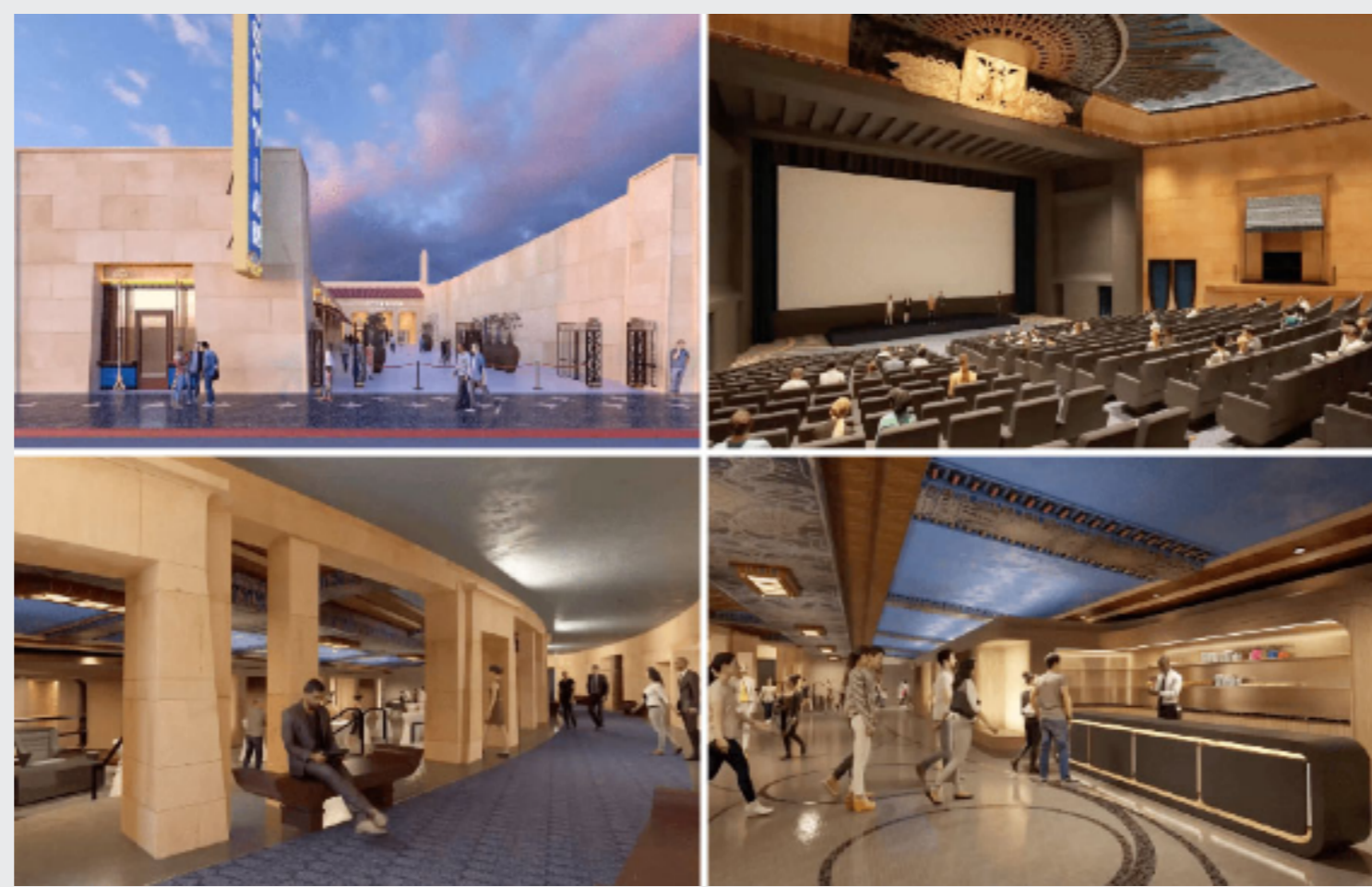
Project renderings by Netflix, as published by What Now Los Angeles .

You can always see the latest updates regarding the Egyptian Theatre, and read up on previous updates, on our website here .